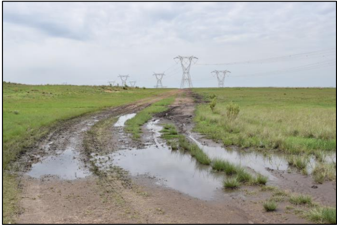
Figure 4: Block roads due to heavy rains