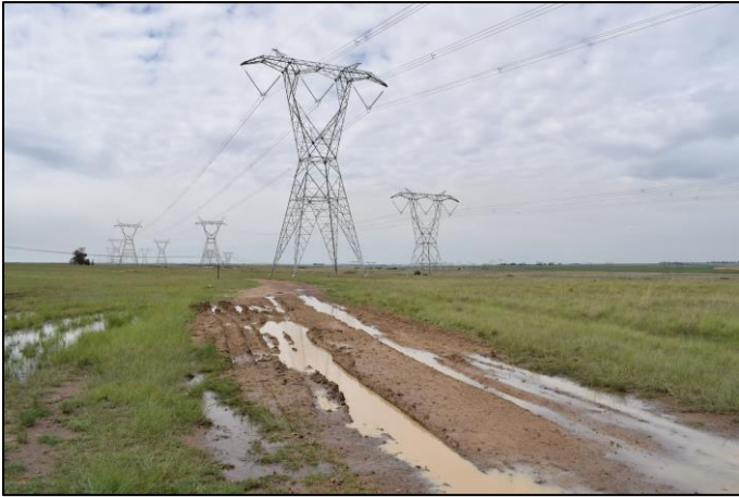
Figure 2: Block roads due to heavy rains