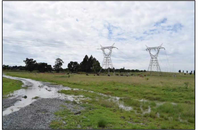
Figure 3: Block roads due to heavy rains